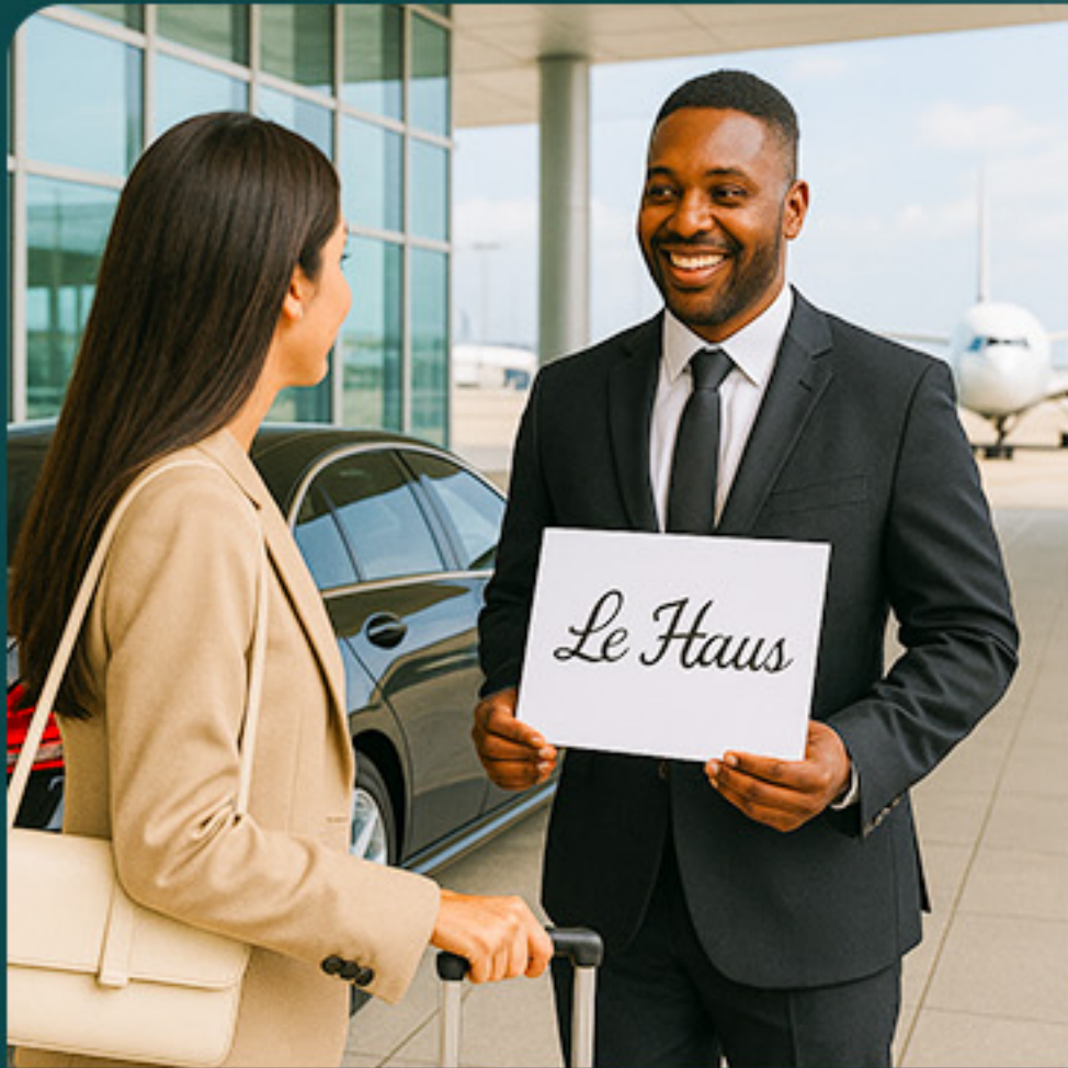
Airport Pickup and Fast Track