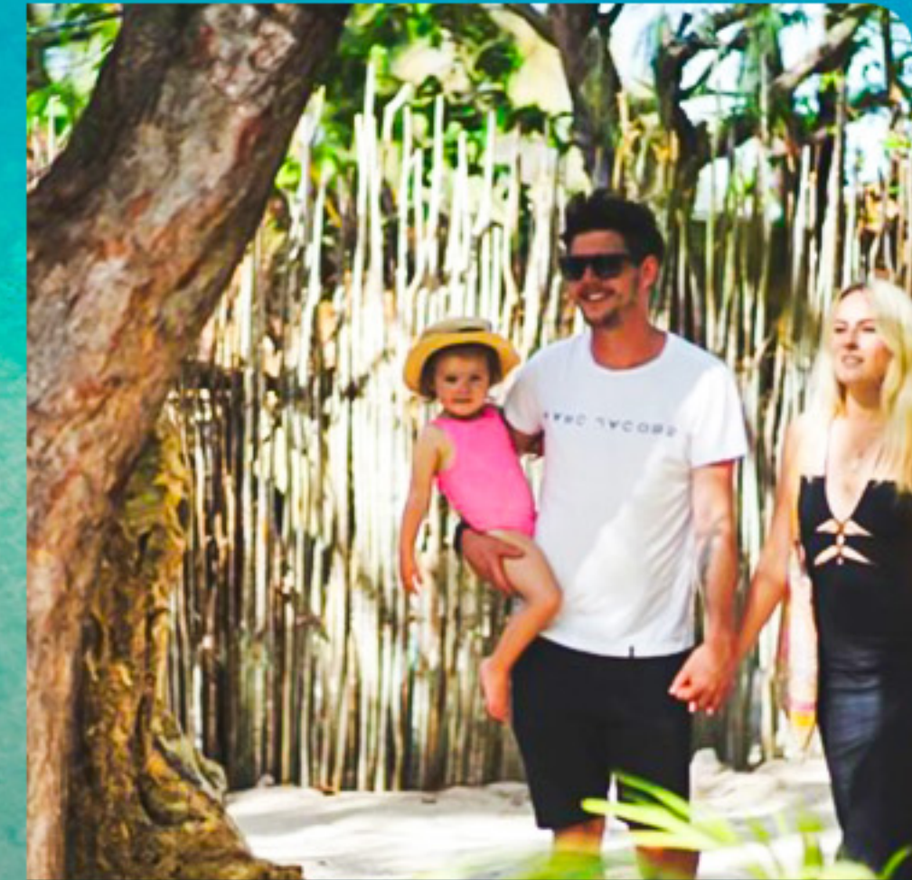
Beach Club Transfers

And so much more! Access reciprocal clubs and experiences around the world through your membership.