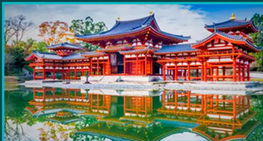
A Journey to Unearth Japan's Ancient Cultures and Crafts