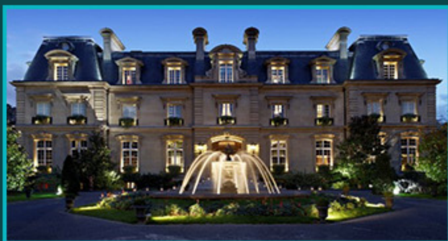
Reciprocal Clubs Around the World