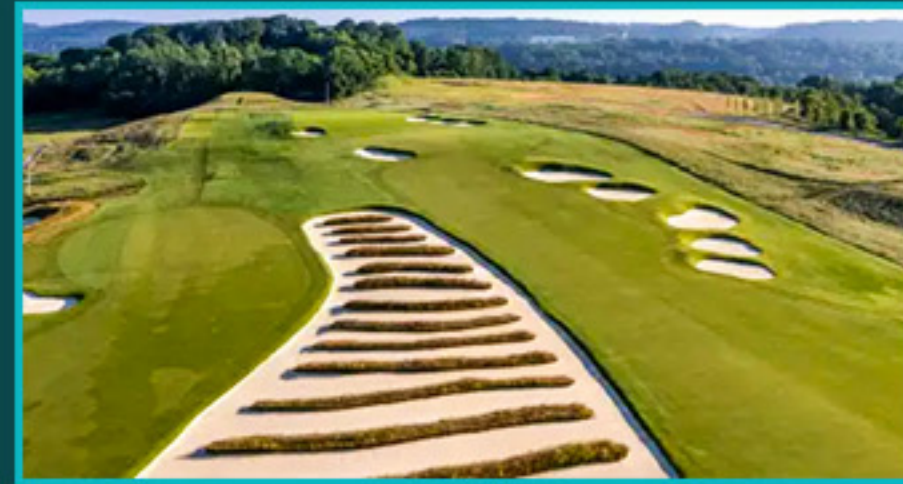
Step into Golfing History: VIP Hospitality at the 2025 US Open at Oakmont