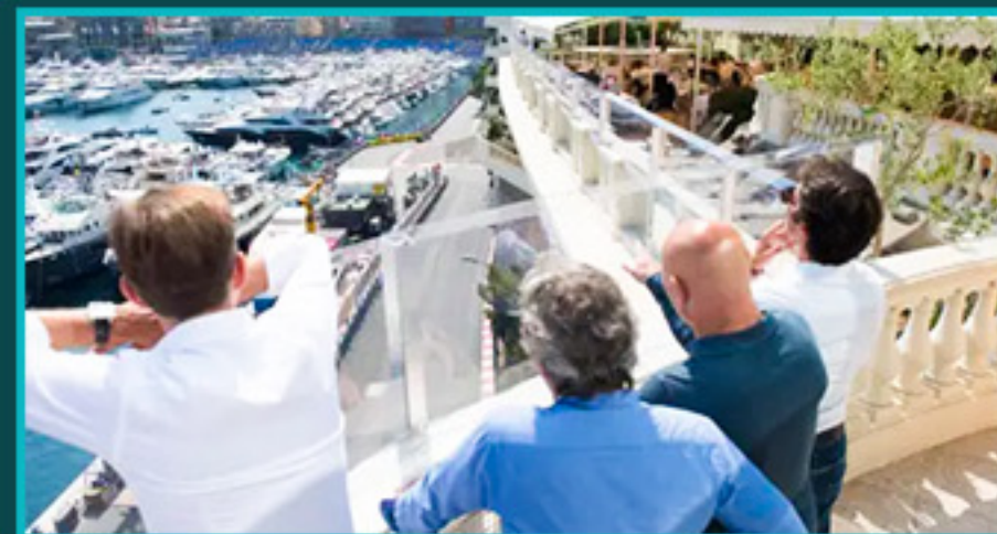
F1 Monaco Hospitality for an Unforgettable Grand Prix Experience