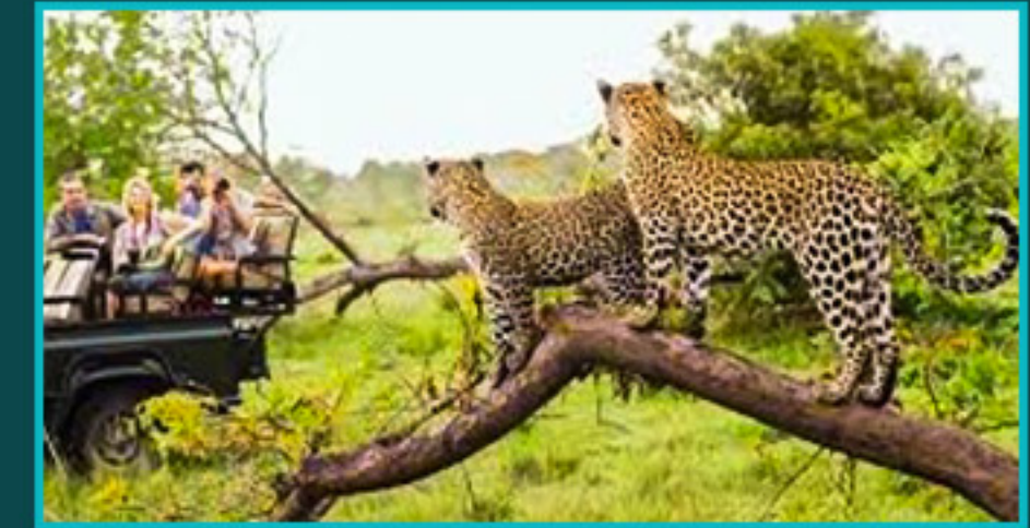
Unrivalled African Safari Experiences