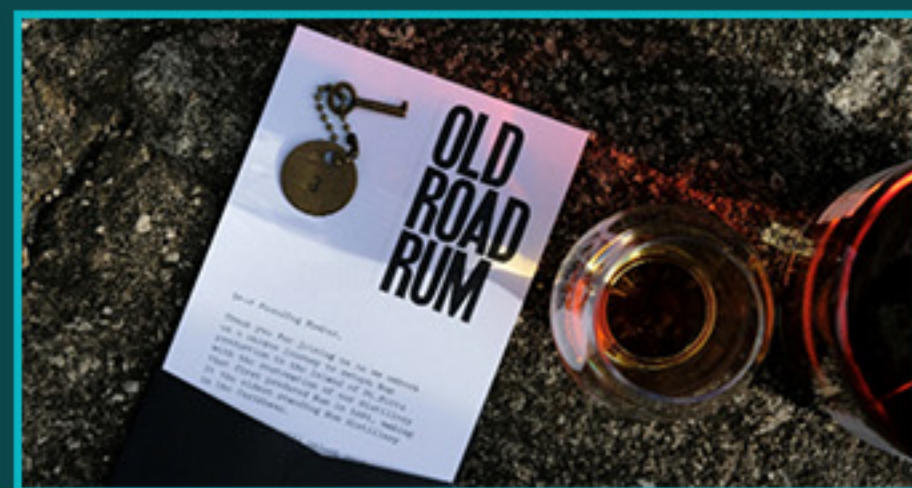
Partnerships with Luxury Brands