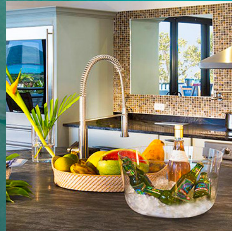
Complimentary Welcome Gift