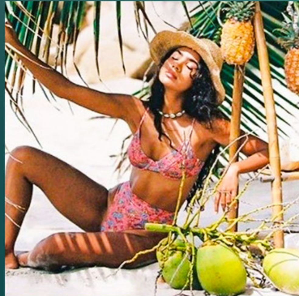
Beach Club Access