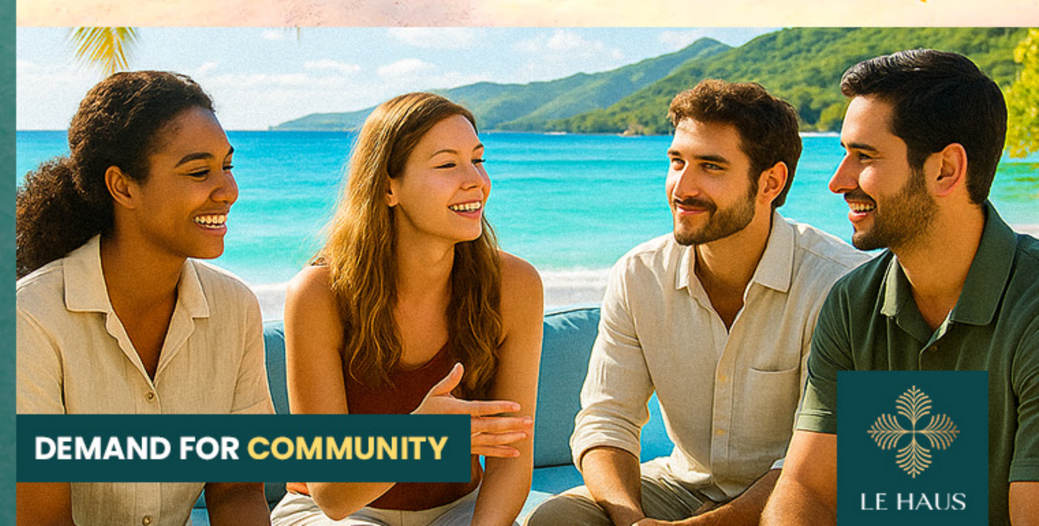
DEMAND FOR COMMUNITY