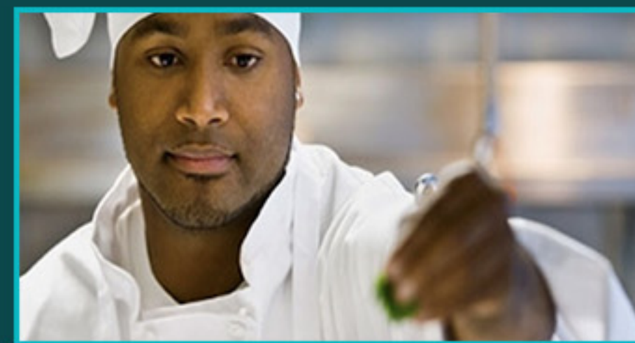
44 New Restaurants Across the Region