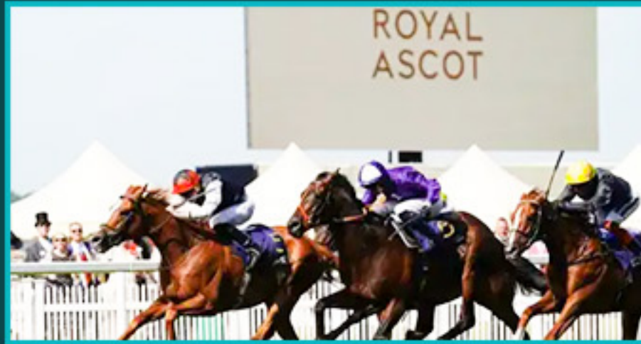
Experience the Elegance of Royal Ascot

Example experiences include but are not limited to: