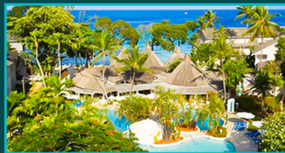
22 New Beach Clubs