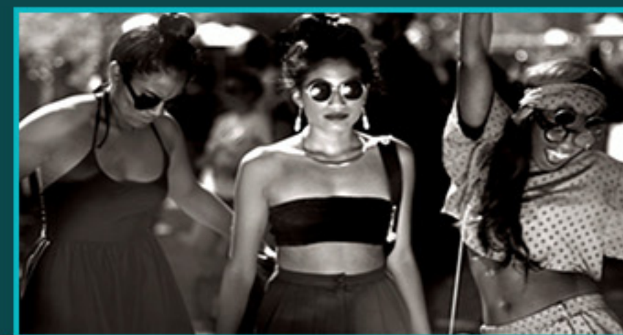
Curated Members Events