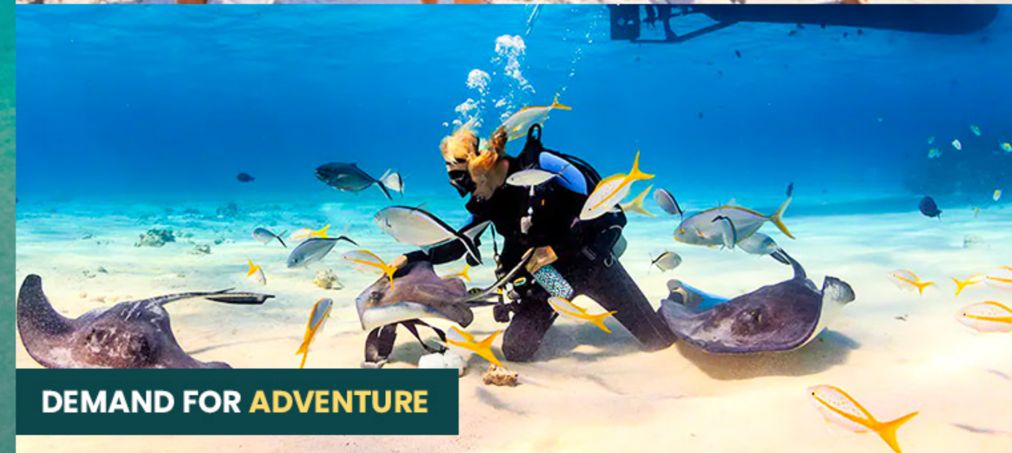
DEMAND FOR ADVENTURE