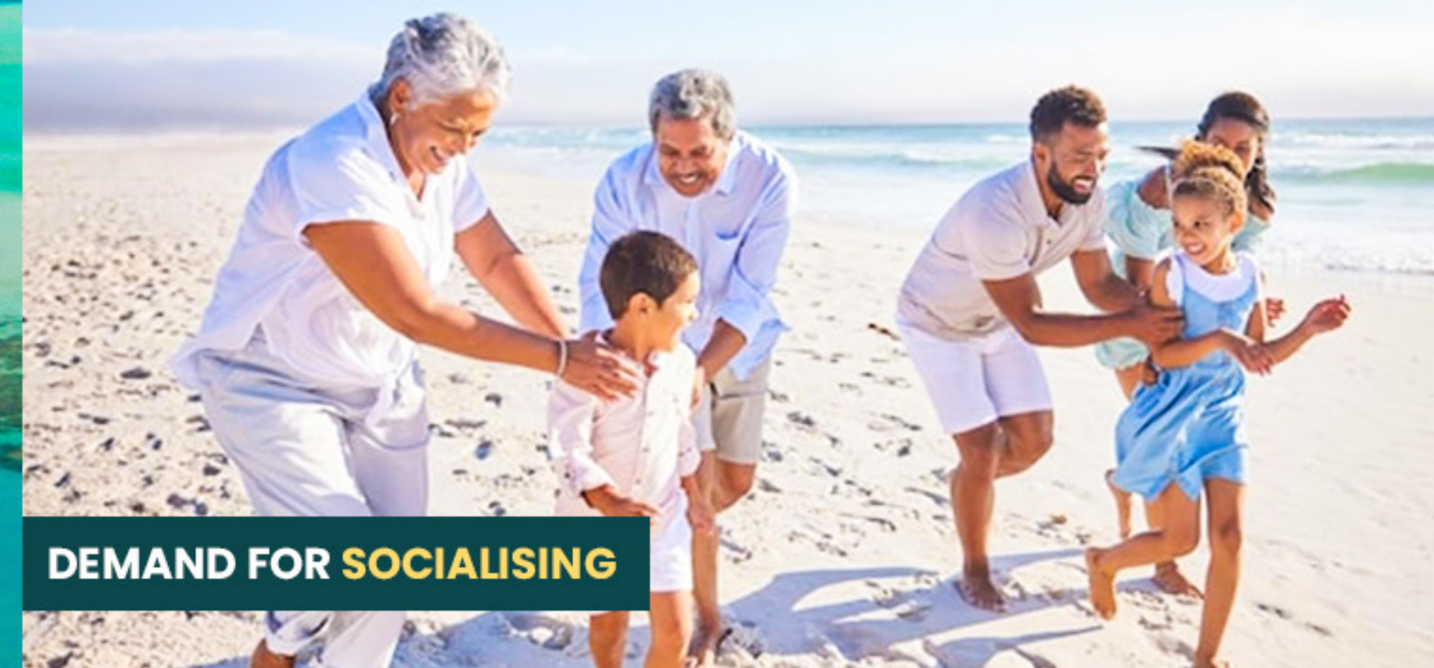
DEMAND FOR SOCIALISING