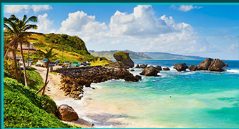
22 New West Indies Locations